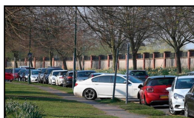
Money to resolve parking issues at key locations.