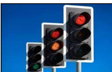
Upgrade to the Northfield roundabout traffic lights