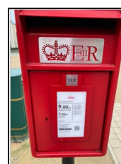
In Cooks Place, Brooklands