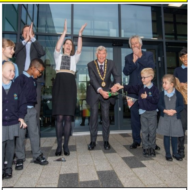
Opening the new St Mary's Wavendon C of E Primary School as Mayor

He has been a school governor of Middleton Primary School and was a member of the national General Teaching Council (the professional body for teachers) until its abolition in 2012. He is currently a trustee of the MK Dons Sports and Education Trust.