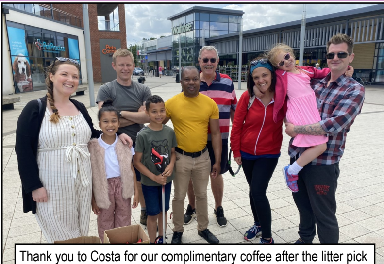
Thank you to Costa for our complimentary coffee after the litter pick

Litter grabbers, gloves & hi-viz jackets supplied