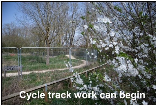
Cycle track work can begin