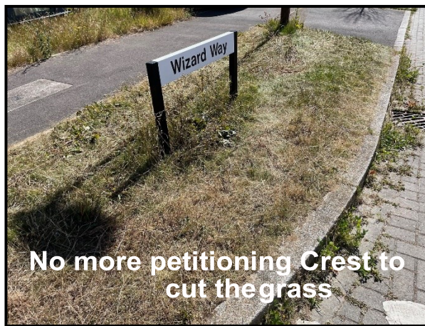
No more petitioning Crest to cut the grass

Great news on the open space “adoption” process. That’s jargon for the maintenance of all the grass, parkland and play areas on Oakgrove except the Waitrose concourse, which is privately owned, and some areas immediately outside flats which Broadoak manage.