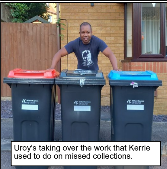
Uroy's taking over the work that Kerrie used to do on missed collections.

A commitment to net zero carbon emissions. Better house insulation and flood control.